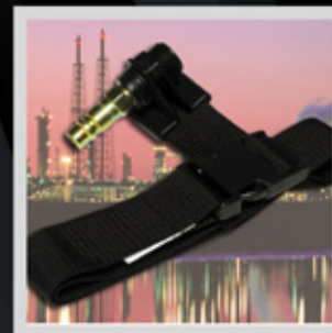
Constant Flow Valve Assembly System. Low Pressure System.