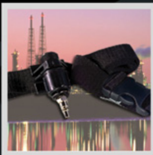
Flow Control Valve Assembly.