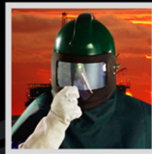
And you can only rip off one lens at a time!