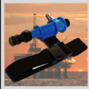
Cold Air Tube Assembly.