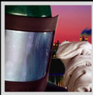
Folded tab design stops dust getting in behind the lens.