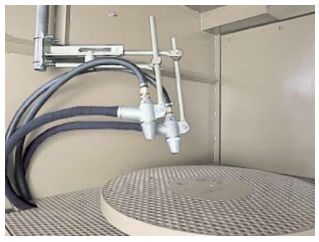
Fixed gun holder frees operator to manipulate parts.