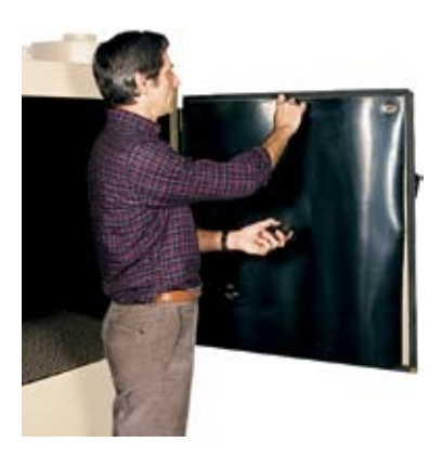
Rubber curtains , available in white to enhance visibility, protect the cabinet interior and are easy to replace.