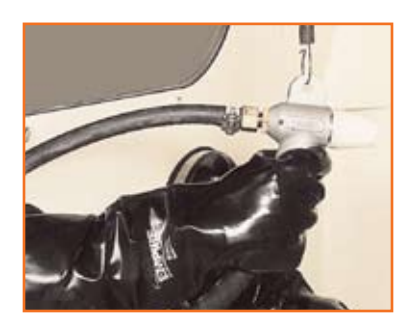
Empire MH-2 blast guns or pressure nozzles are available with tungsten carbide or silicon carbide to reduce wear with certain types of media.